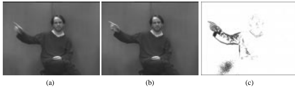
Figure 1: Example of differencing two consecutive frames (a) and (b), result in (c), from a ‘point with the right hand to the right’ ( pntrr ) gesture.