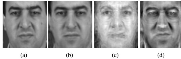
Figure 2: Reconstruction from subspace representations: (a) original image, reconstruction using (b) PCA (191 coefficients), (c) LDA (199 coefficients) and (d) SVM (37 coefficients) subspaces. All subspaces were obtained from unnormalised data.